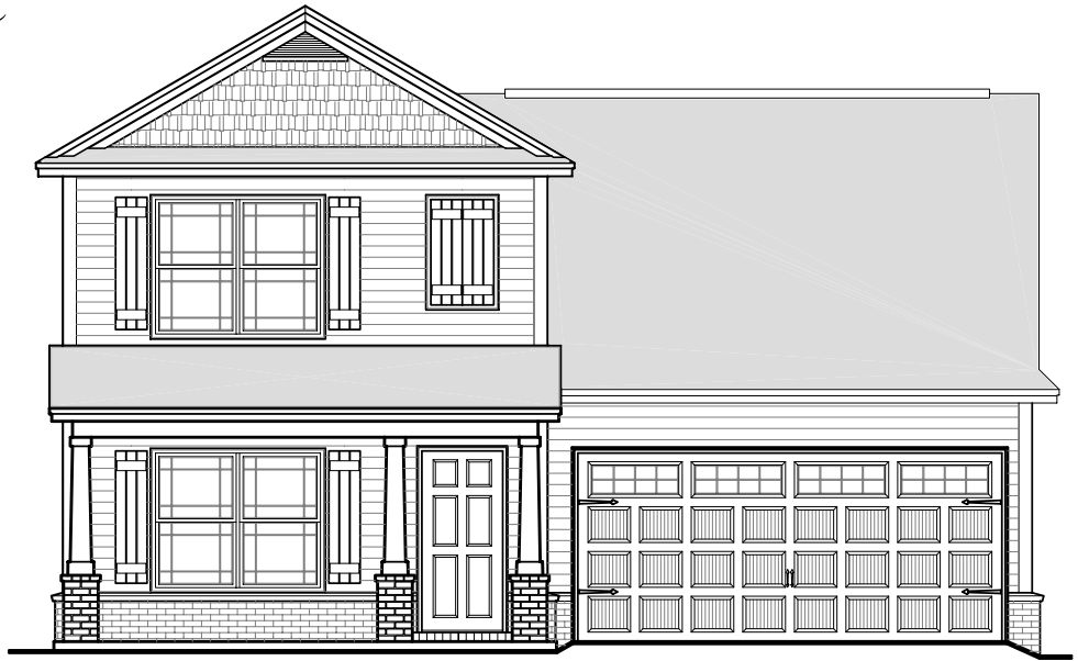
ACCENT FRONT ELEVATION