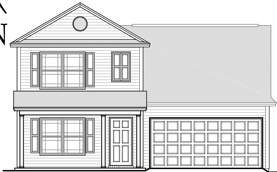
VINYL FRONT ELEVATION