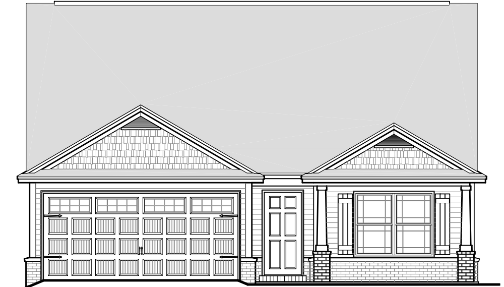
ACCENT FRONT ELEVATION